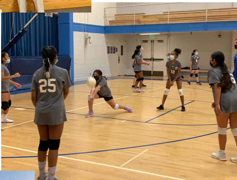
The girls warm up before their game.