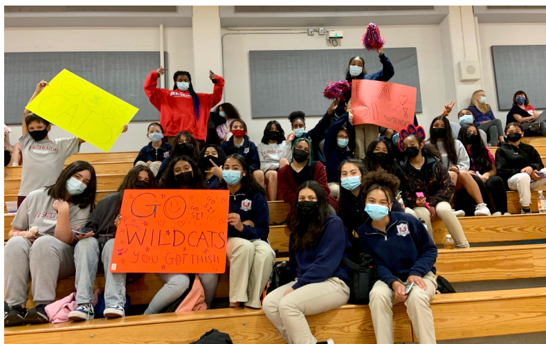
The FSA Volleyball team cheering at SI's JV volleyball game!