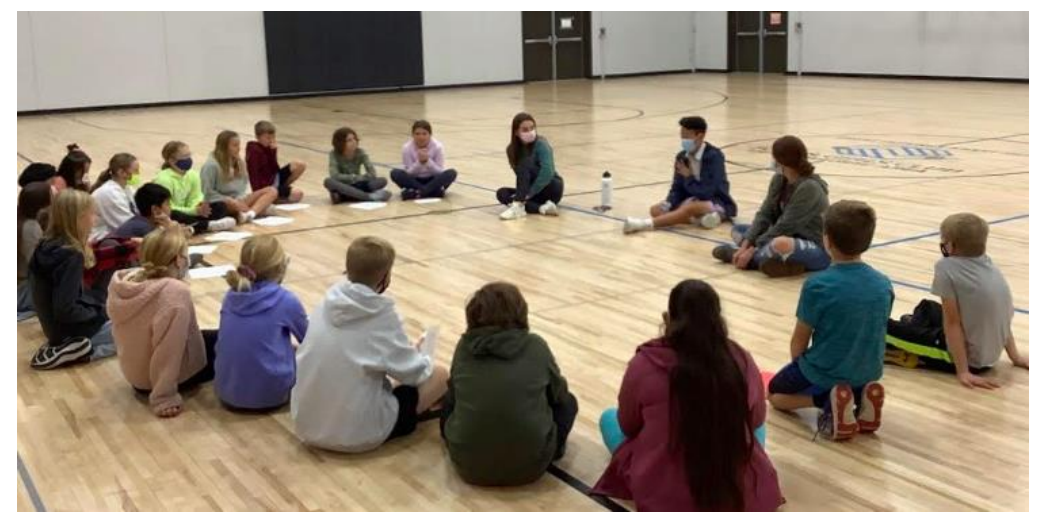
Westside Elementary Leadership students with their Wausau West High School mentors, all three of which were Leadership students in 5th grade themselves!

Who can attend the GT Leadership Conference? By state mandate, each school district in Wisconsin is required to identify students with high leadership ability as part of their Gifted and Talented program, and to provide "systematic and continuous" programming that will enable these students to develop leadership abilities to their full potential. Classroom teachers in grades 3-5 completed observation checklists to identify students with high leadership potential. Students from each elementary school who met the criteria for GT Leadership Conference were invited to attend.