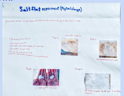
6th Grade Science Inquiry into Matter

"I like being a BU Link student because it is fun and interactive in my 6th grade online classes. From my experience online, the teachers are nicer at BU Link."