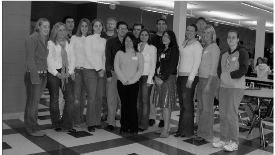
Recent graduates visited The Gilbert School for Young Alumni & Career Day on November 23 rd .

Alumni from the Classes of 1996–2005 were invited to The Gilbert School for a special breakfast and to talk with our current seniors about college, work experiences and life in general beyond Gilbert. This year, sixteen alumni took time out of their busy schedules on the day before Thanksgiving to visit Winsted and share stories and advice.