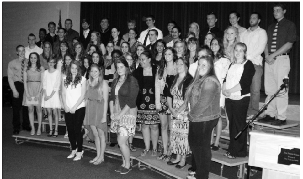
The 2013 recipients posed for a group photograph after receiving their scholarships. More than 60 seniors and alumni/ae received $112,226 in aid for higher education.