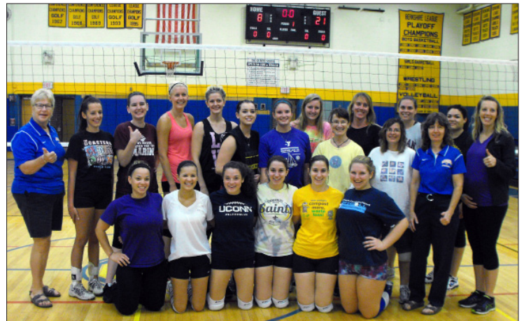
The alumni volleyball game attracted a record number of players.