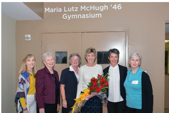
Maria Lutz McHugh '46 Gymnasium, named after Gwynedd's first Athletic Director