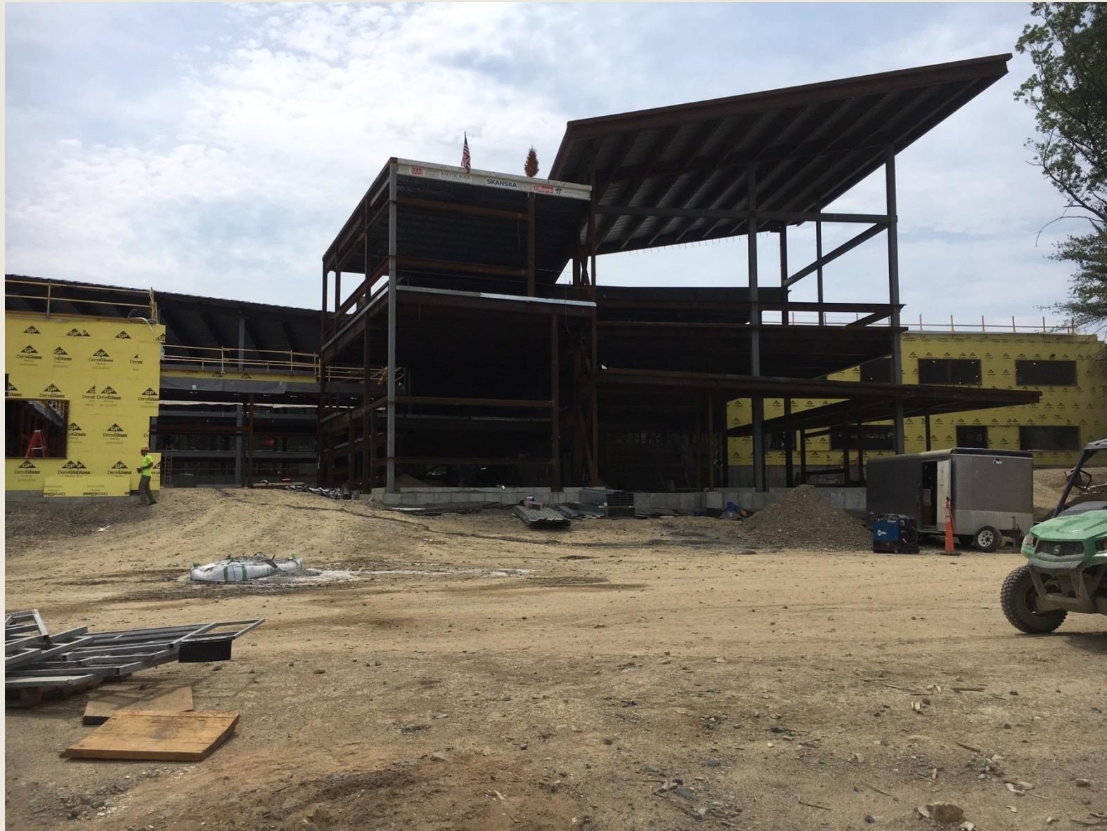
Main Entry Approach