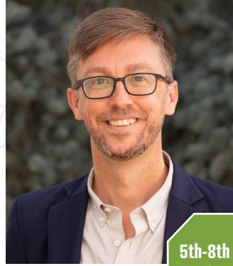
5th-8th Grade Director

Welcome! It is a thrill to lead as Lower School Director of Aspen Academy. It is truly an honor to be a part of a community living and holding each other accountable to the values of kindness, hard work, and seeking to do good in all facets of life. Combined with the values of Aspen Academy, our exceptional team of educators will strengthen next-generation education skills through relevant, meaningful, and engaging learning and reinvigorate our commitment to character and leadership development through Future Holders one-of-a-kind curricula and instruction. Relationships are at the heart of a thriving community and it is my goal that each student and family feel a strong, deep sense of love and belonging during a time that will put our commitment to those values to the test. We are committed to one another more than ever and I look forward to knowing and serving all students and families in the upcoming year!