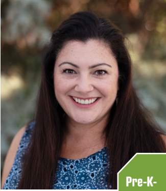
Pre-K- 4th Grade Director