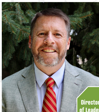
Director of Leadership and Programs