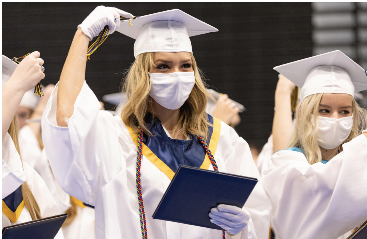
Members of the Class of 2021 turn their tassel as they proudly accepted over $30 million dollars in scholarships.