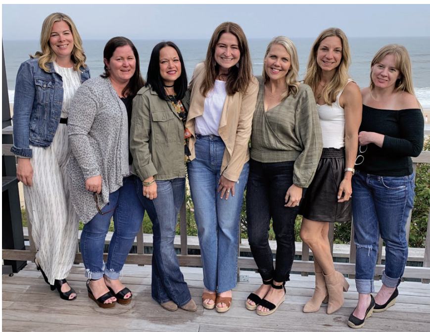
Members of the Class of 1996 gather at their annual reunion. To schedule your reunion, contact Alumnae@NazarethAcademyHS.org .

Nazareth taught me the importance of self-confidence and self-worth. We were young girls maturing into young women, and at this critical turning point, we