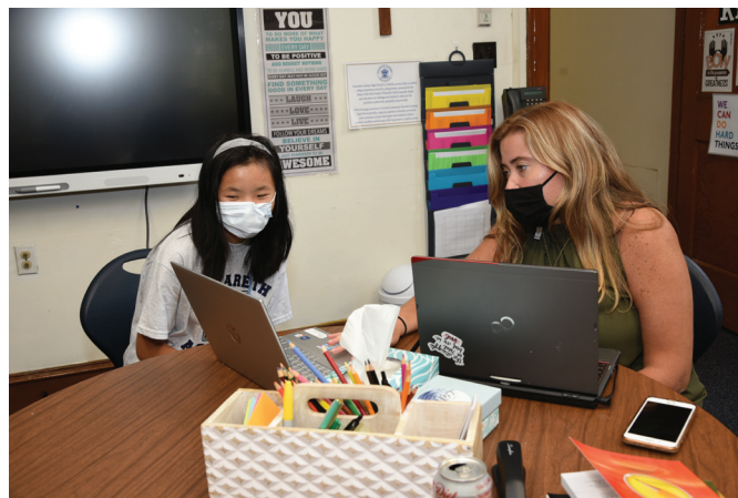
The Academic Enrichment Program supports students' needs without modifications to our rigorous college-prep curriculum.