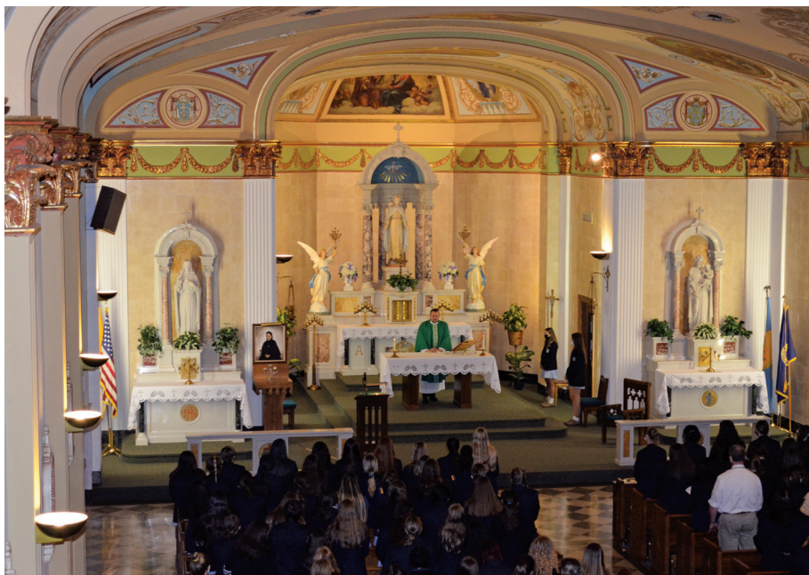
As part of our mission, the Nazareth school community gathers regularly as a family to celebrate and strengthen our faith.