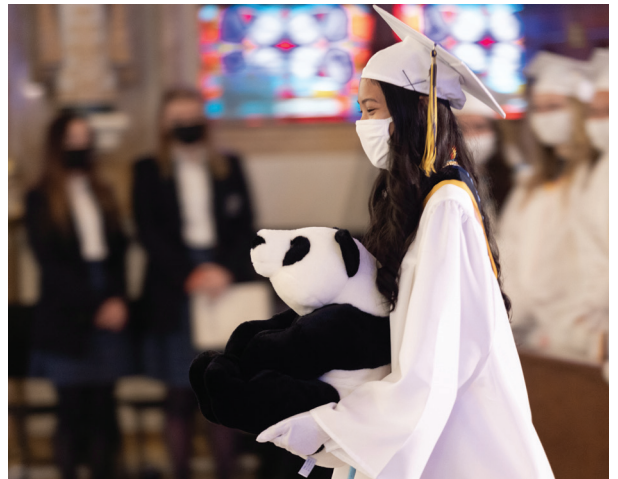
The Panda is presented at the Class of 2021 Baccalaureate Mass to represent our beloved school mascot.