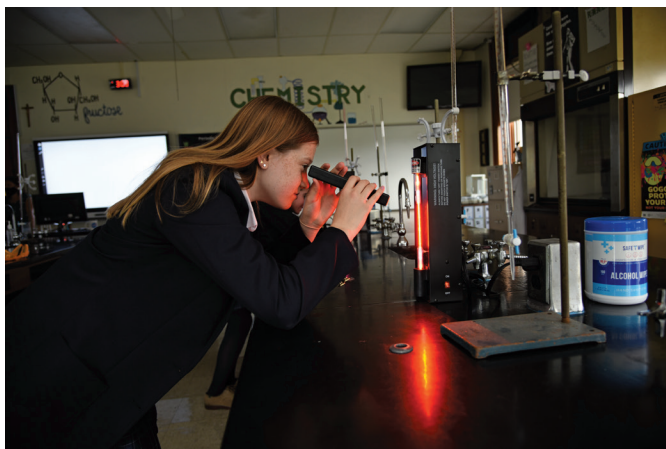
Our STEM Curriculum develops essential skills that our students will use in the real world.

The academic curriculum at Nazareth Academy provides many paths to pursue academic excellence, challenging each student to attain her full potential academically, spiritually and personally.