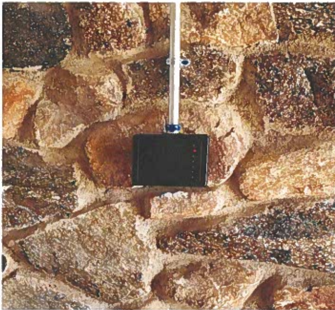
New door access readers

Throughout the year, enhancements were made to the safety and security of the Amity schools. These include additional card readers, camera improvements and additional safety film installed on windows.