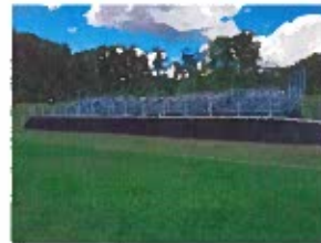
New track and field three bleachers