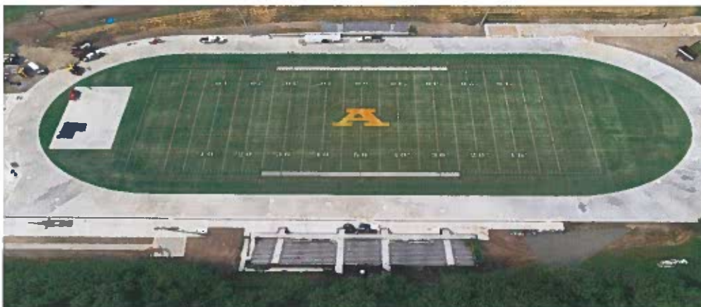
Concrete track surface and new artificial turf

“The entire Amity Custodial staff went above and beyond this school year working with ever changing cleaning guidelines to follow, schedule changes, classroom layouts, picnic table assembly, whatever came their way they handled with pride and professionalism. The Amity maintenance staff too worked tirelessly on dividers, curtains, barricades, HVAC requirements, whatever it took to not only get these buildings open, but to be flexible and creative in working to keep up the changes and demands that the COVID era brought us. They were able to keep up with all of this and still find time for normal preventative maintenance schedules, routine scheduled cleaning, a rough winter and the day to day emergencies that pop up. “I cannot say enough about how proud I am to work with such an amazing group of people.” Steve Martoni Director of Facilities