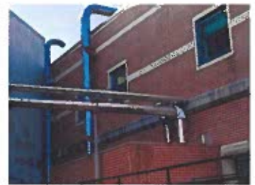
Relocated heating return piping