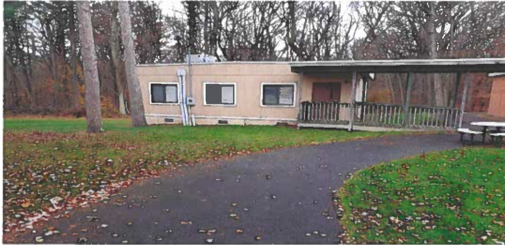
Before and after AMSO modular demolition