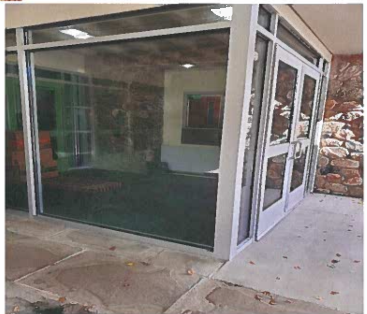
Window film upgrades