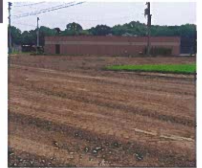
Ready for paving