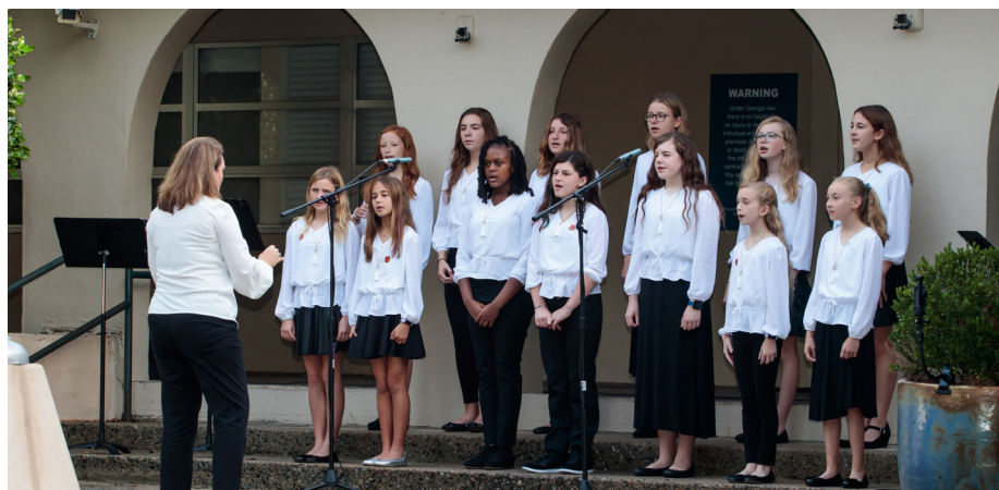
Middle School Chorus, Veterans' Day Assembly