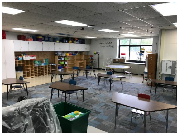
Figure 2 Elementary Classroom