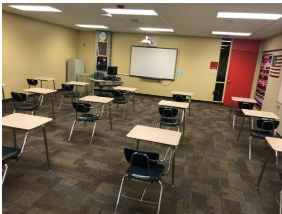
Figure 1 Secondary Classroom

Where possible, all student workstations will be placed so that students are facing the same direction. The following are examples of secondary and elementary classrooms set up with three feet between students: