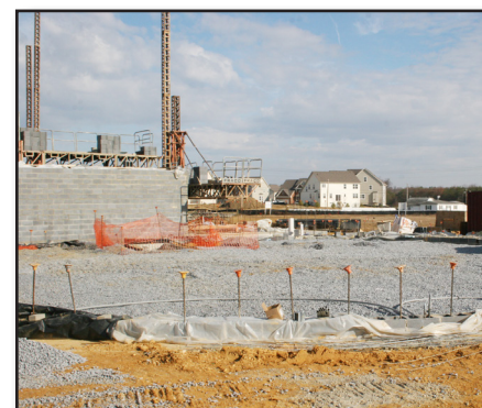
Pictured is the outer ring of the digital classroom planned for St. Charles High School. School construction will be complete in the spring of 2014.

A high school redistricting committee is meeting to develop alternatives for the Board of Education to consider while creating an attendance zone for St. Charles and alleviating overcrowding at other schools. The Board is expected to make a decision on redistricting in June, a little more than a year before St. Charles opens.