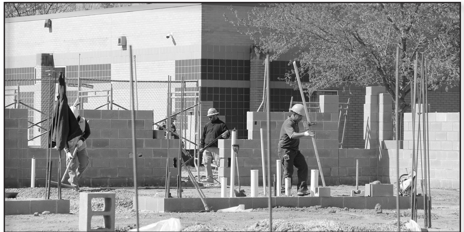
Workers with Scheibel Construction work on classroom additions at Mary H. Matula Elementary School.