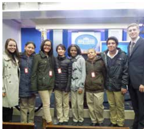
(Top to bottom): 6th graders in yoga class; Students on a field trip at the Highline during summer session; Students during swimming class at Asphalt Green; 8th grade students in the White House press room