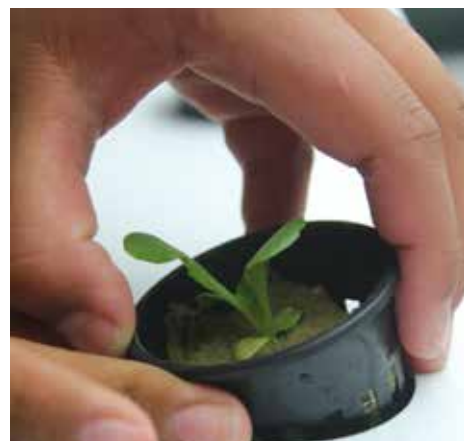
Students transplanting in our classroom green house