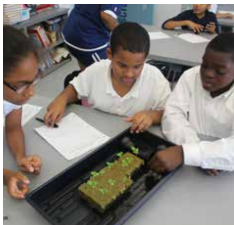
6th graders in Science class