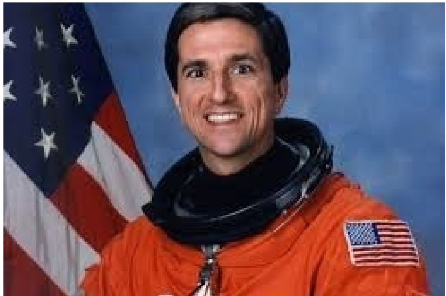
Donald A. Thomas, Ph.D. and Former NASA Astronaut