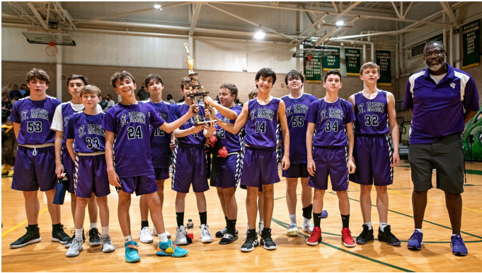
2020-2021 7TH & 8TH GRADE MIDDLE SCHOOL BASKETBALL CHAMPIONS