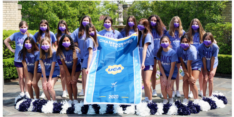
2020-2021 MIDDLE SCHOOL CHEERLEADERS 2ND PLACE