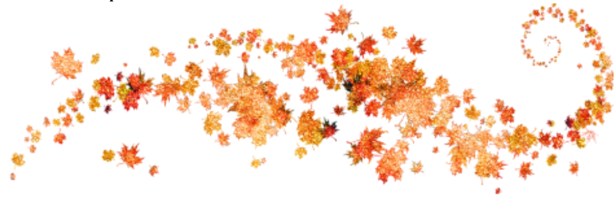
SOUP FOR CLOTHING

Donation of canned goods would be greatly appreciated but not required!!