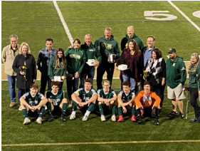
The Notre Dame Boys Varsity Soccer team celebrated Senior Night in the win over Fowlerville