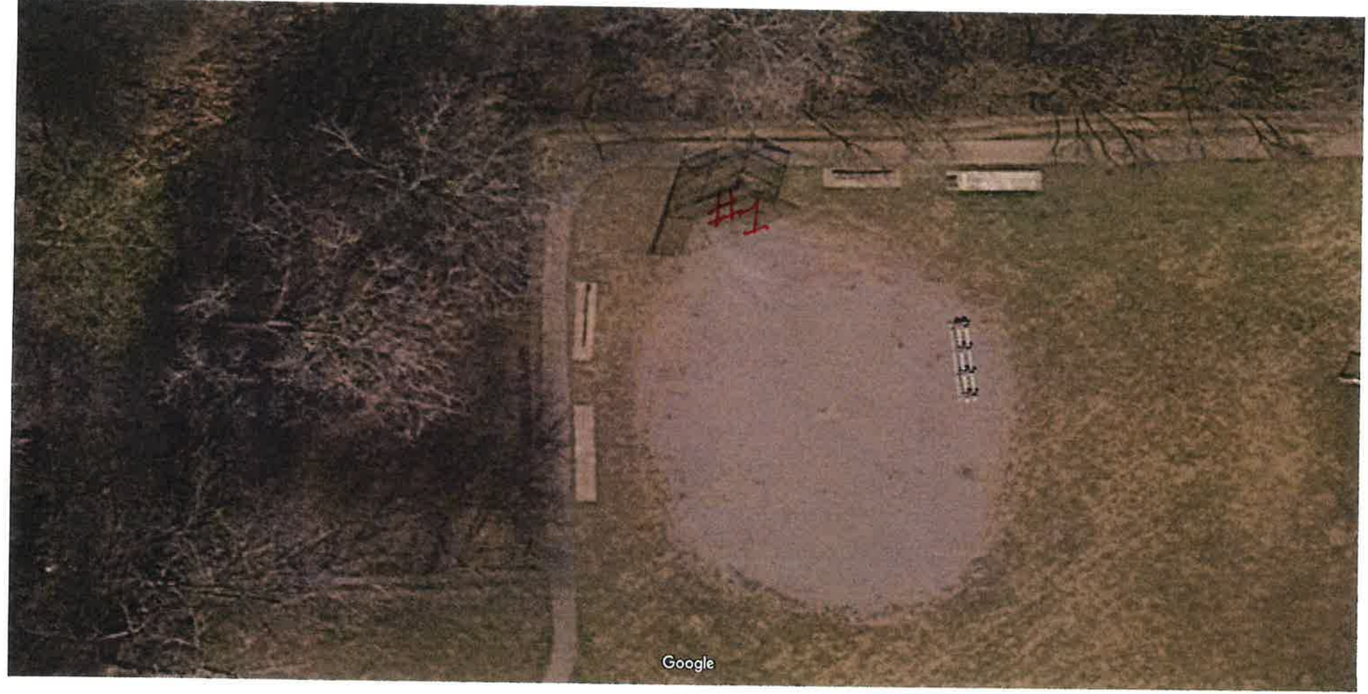
linagery ©2021 Maxar Technologies, Map data ©2021 20 ft