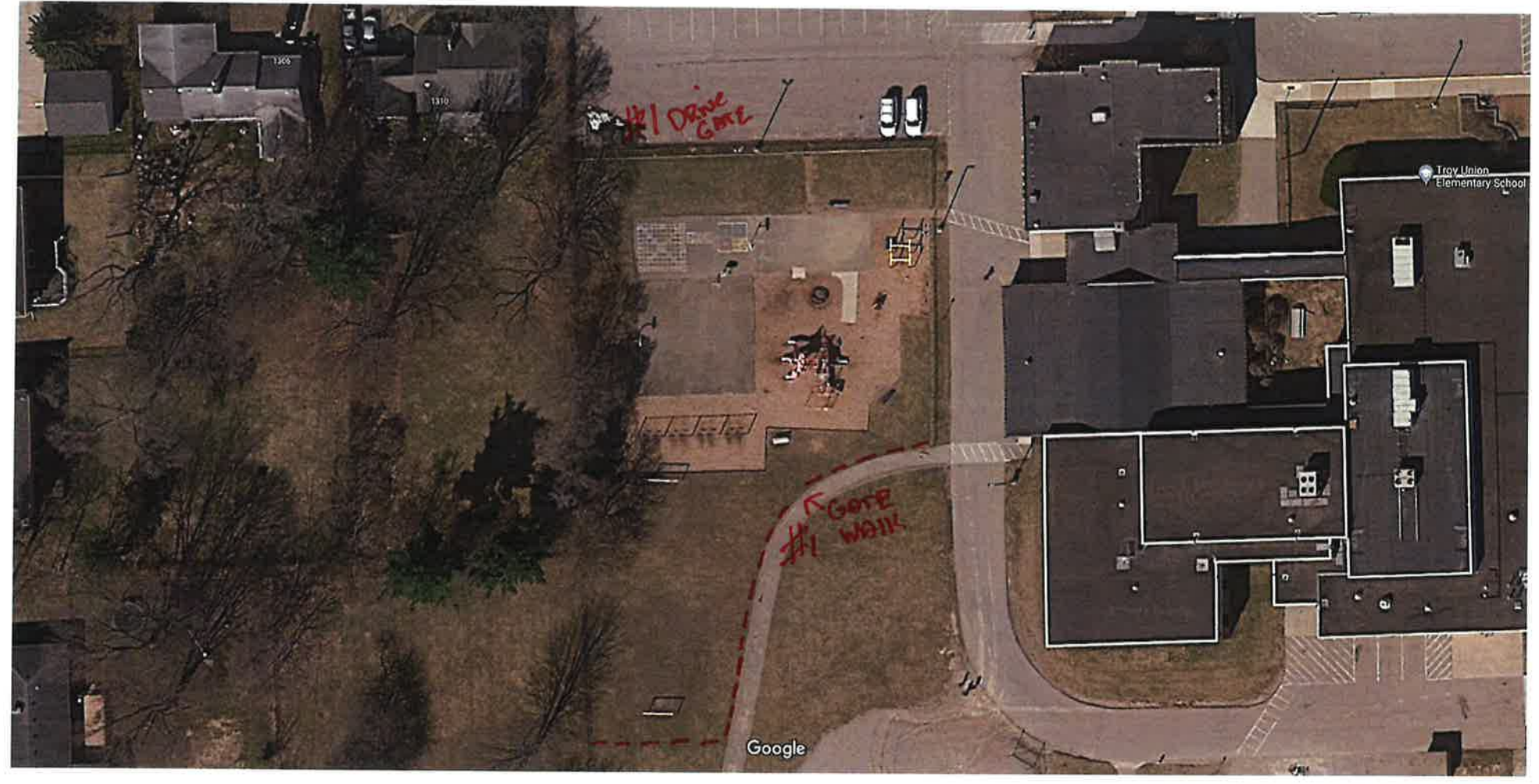
Imagery ©2021 Maxar Technologies, Map data ©2021 20 ft