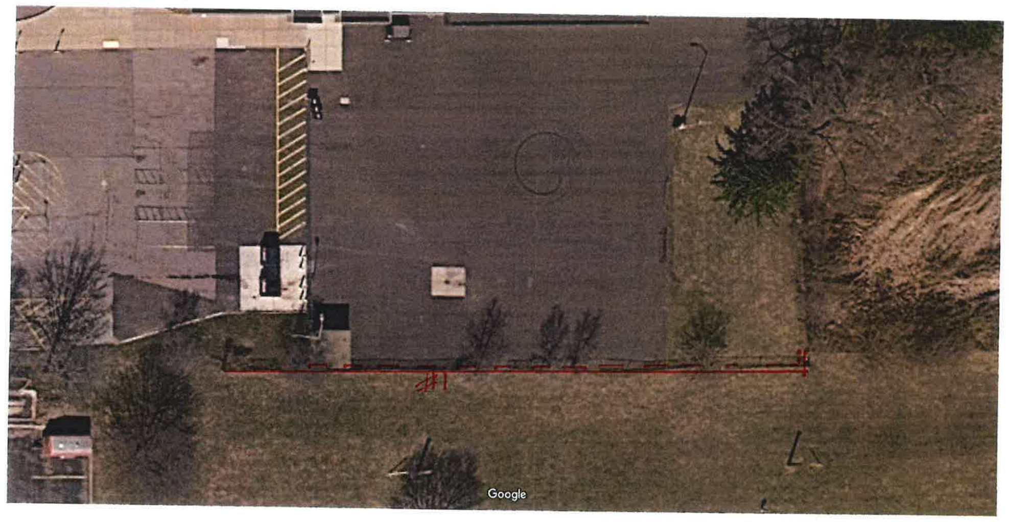
Map data @2021 , Map data @2021 20 ft