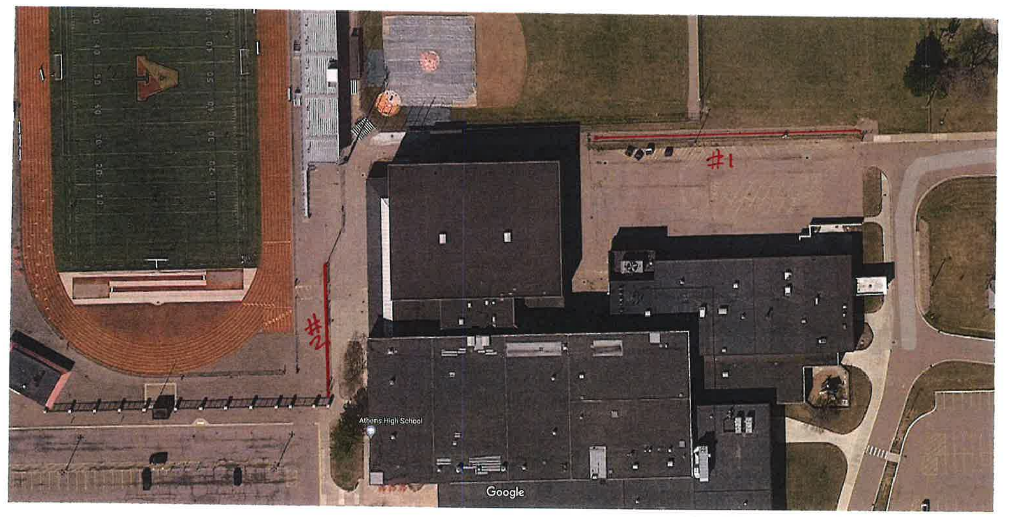
Imagery ©2021 Maxar Technologies, U.S. Geological Survey, Map data ©2021 50 fl