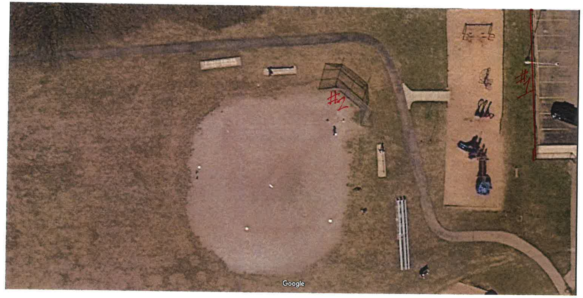
20 ft