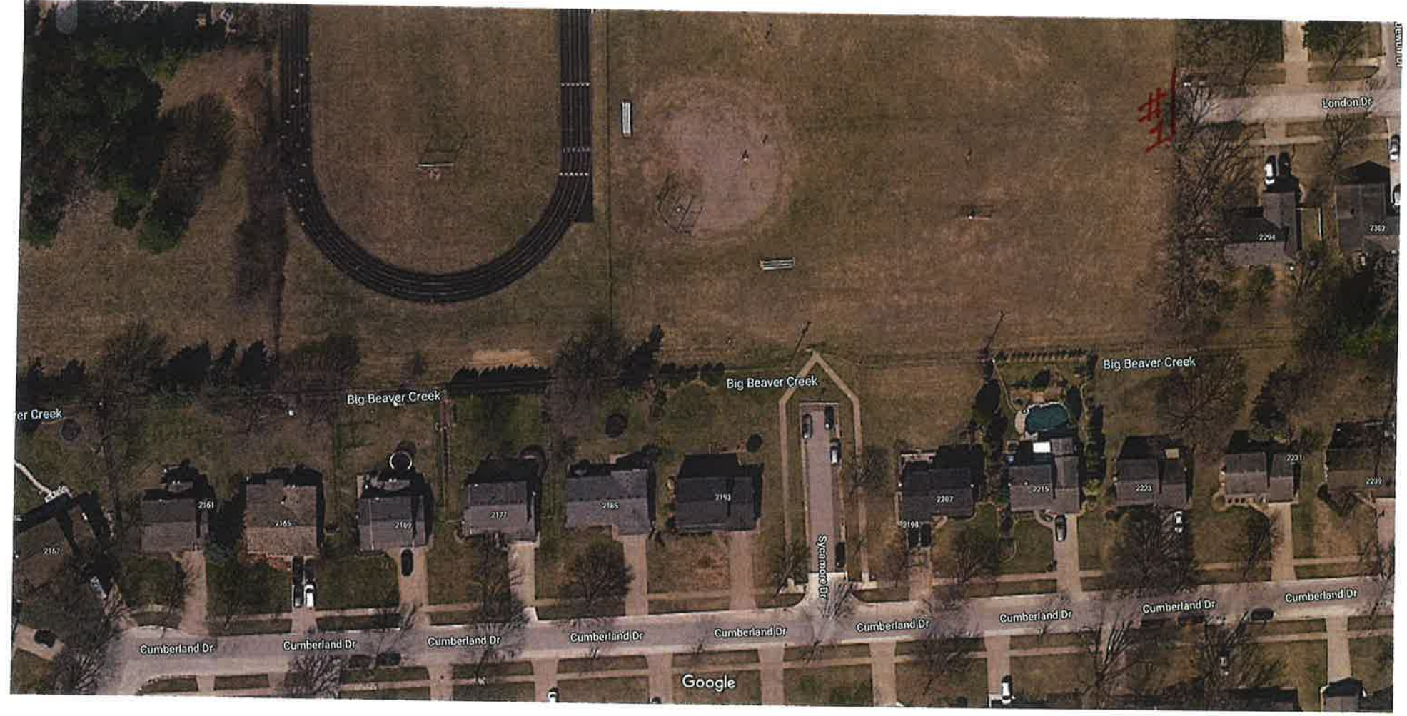
Imagery ©2021 Maxar Technologies, U.S. Geological Survey, Map data ©2021 50 ff