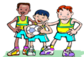
Work together, be kind, and respect each other.