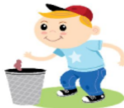
Take care of your things.