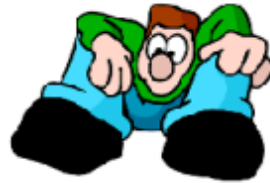
Feet and hands to yourself.