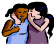
Small voices inside, tall voices outside.