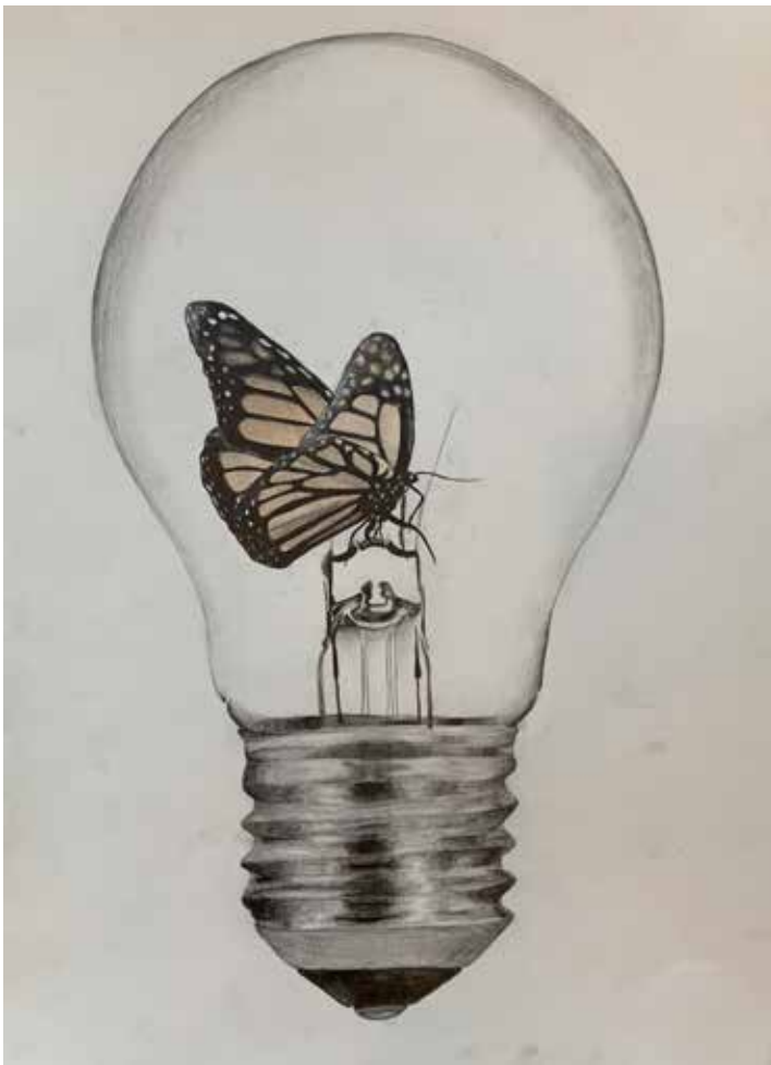
Saylor Sprenger, Gr. 12