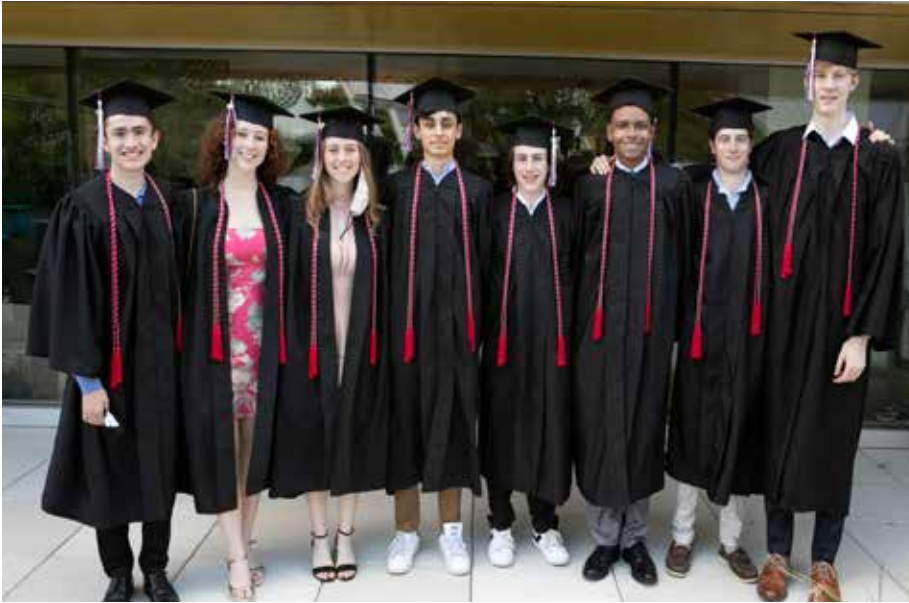
A group of 2021 graduates at Packer's commencement ceremony.