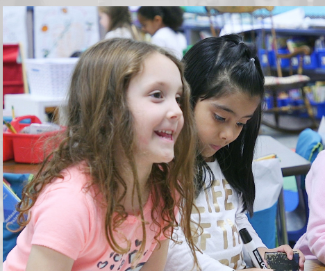
Dual Language Program