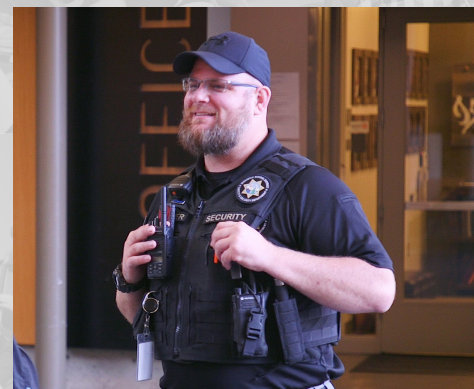
Safety in our Schools