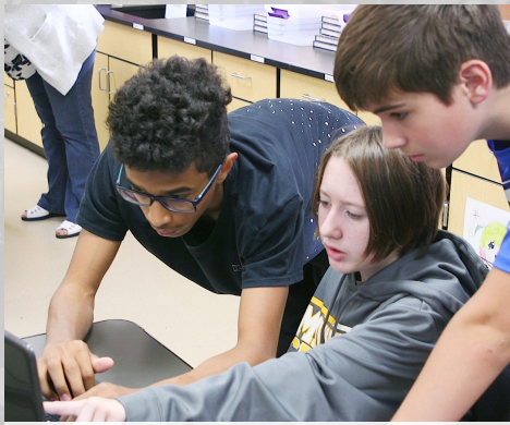
What is Funded by Levies?