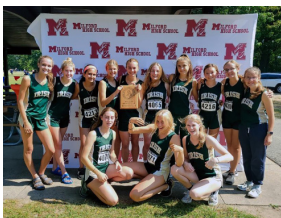
The Notre Dame Girls Varsity Cross Country team took first at the Averill Distance Invite while the Boys finished seventh

Boys JV/VAR Soccer vs. Melvindale/Armada 5:30/7:00