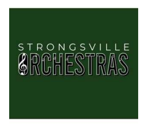
Front Design #1