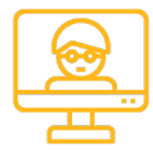
FULLY-ONLINE LEARNING PLATFORM

The well-being of our students and staff is our top priority. We are aware regulations and situations concerning COVID-19 are changing daily. The plans we have in place now can rapidly change. If we are required to change our plans, we will communicate those changes with you by email, our website, phone call, and social media platforms. As we navigate and make choices that impact our school community, we are appreciative of your flexibility, patience, and support.