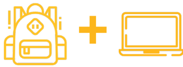
HYBRID LEARNING ENVIRONMENT