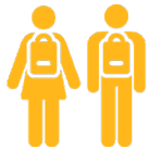
TRADITIONAL IN-PERSON LEARNING