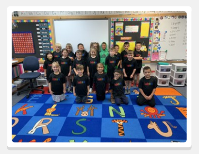
1st Grade Leaders