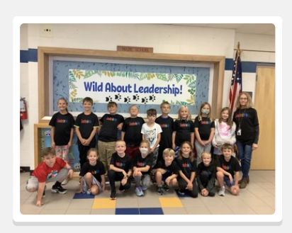
2nd Grade Leaders