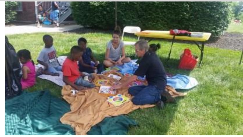
The educational activities and tips for healthier habits were just as popular with many local youth as the free nutritional meals. More than 15,000 meals were served over the summer as part of the