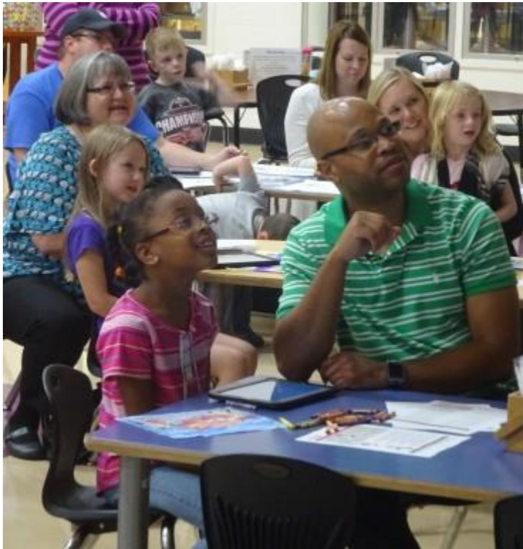
Above: Wyandot's Technology Night started off with an interactive survey using a popular digital app. Below: First grade students taught their families how to use the apps that are featured in their technology special class.

“Families have an idea of what takes place in an art class, gym class or a music class. But our technology class is a new concept – and who better to teach this new concept than the first-graders themselves?”