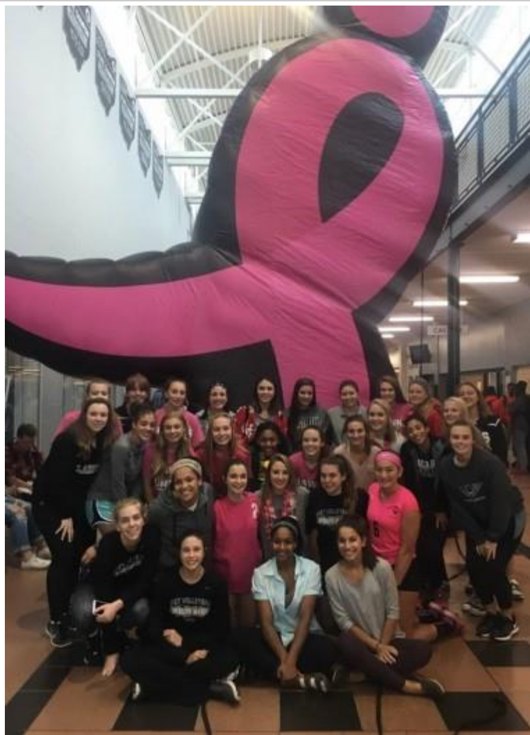
The volleyball teams at Lakota East (above) and West (right) both host big events to raise money and awareness for breast cancer. Over $25,000 was raised through this year's efforts alone.