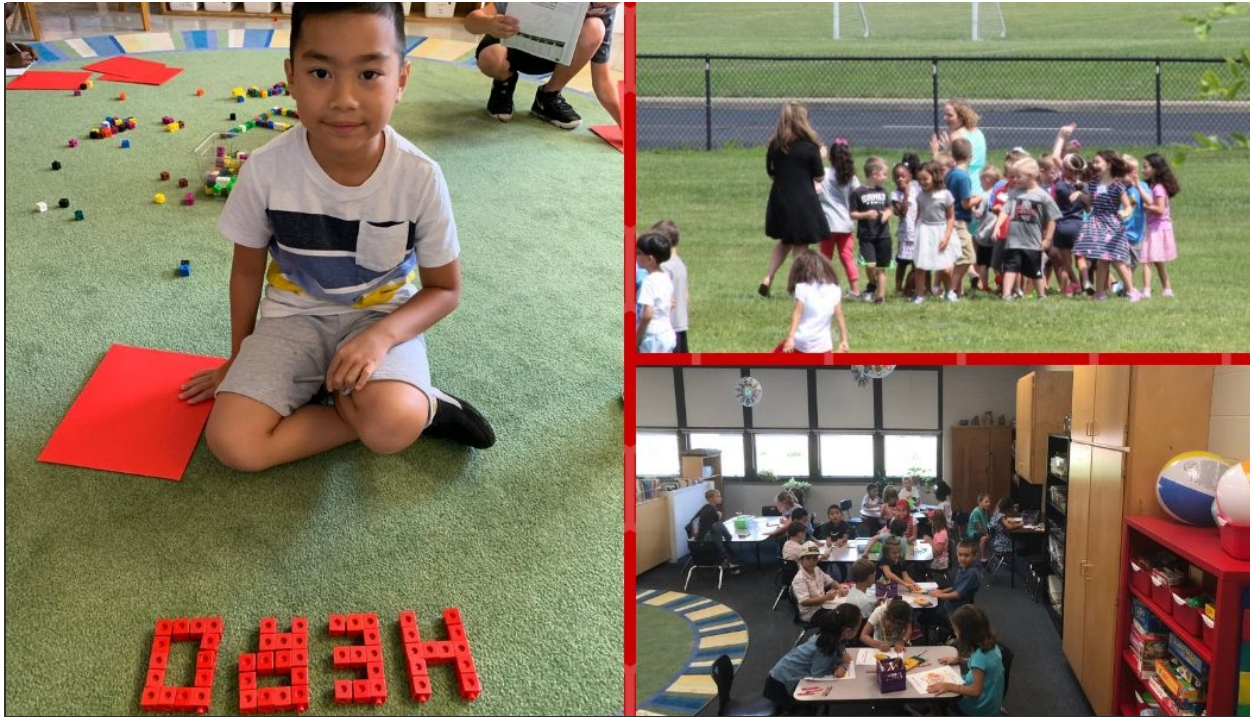
First and second graders at Hopewell ECS took part in "Hero Training" to kick off the school year.

From how to sit in class to taking advantage of extracurricular activities, learn from the experts by clicking here to watch this special video featuring student voice .