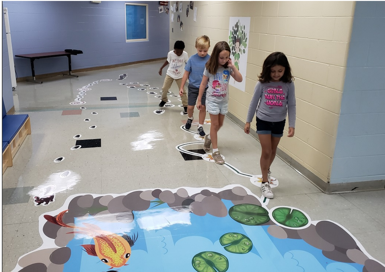
Shawnee Early Childhood School is one of ten Lakota buildings with new sensory paths. These movement paths offer endless possibilities to increase student focus and learning.