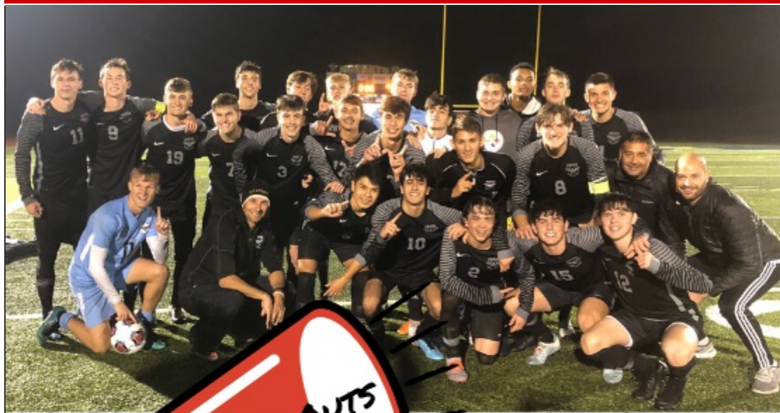
East Boys Soccer in Regional Elite 8 (left)