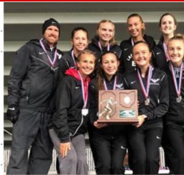
----- East Girls Cross Country Statebound (right)