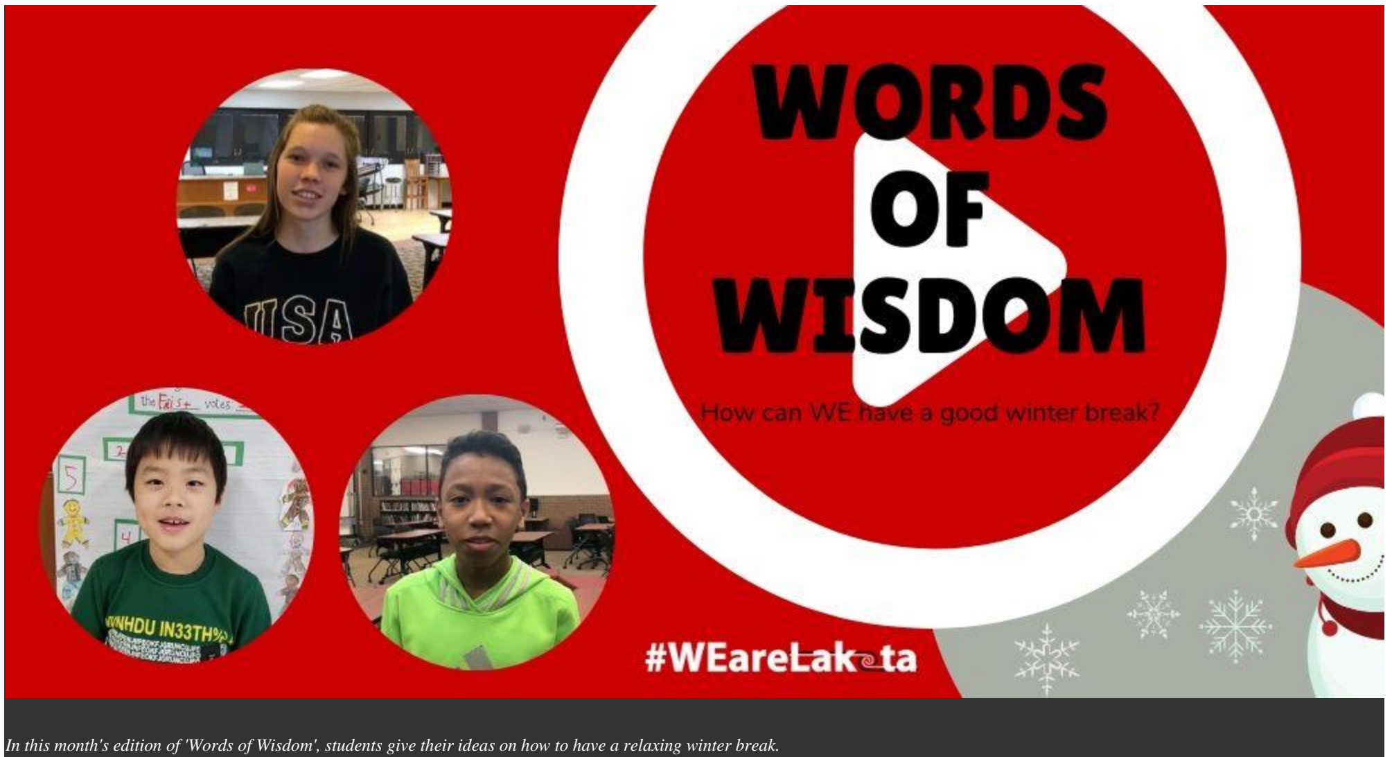
In this month's edition of 'Words of Wisdom', students give their ideas on how to have a relaxing winter break.