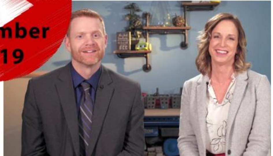
Click above to see some December highlights as Lakota closes out 2019.