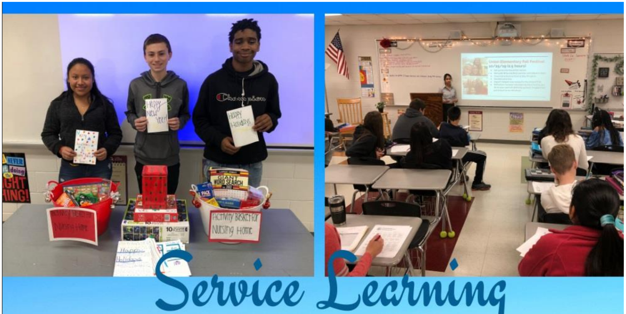
Lakota East Freshman English classes were challenged to use words from 'Tuesdays with Morrie' as inspiration for a community service project.