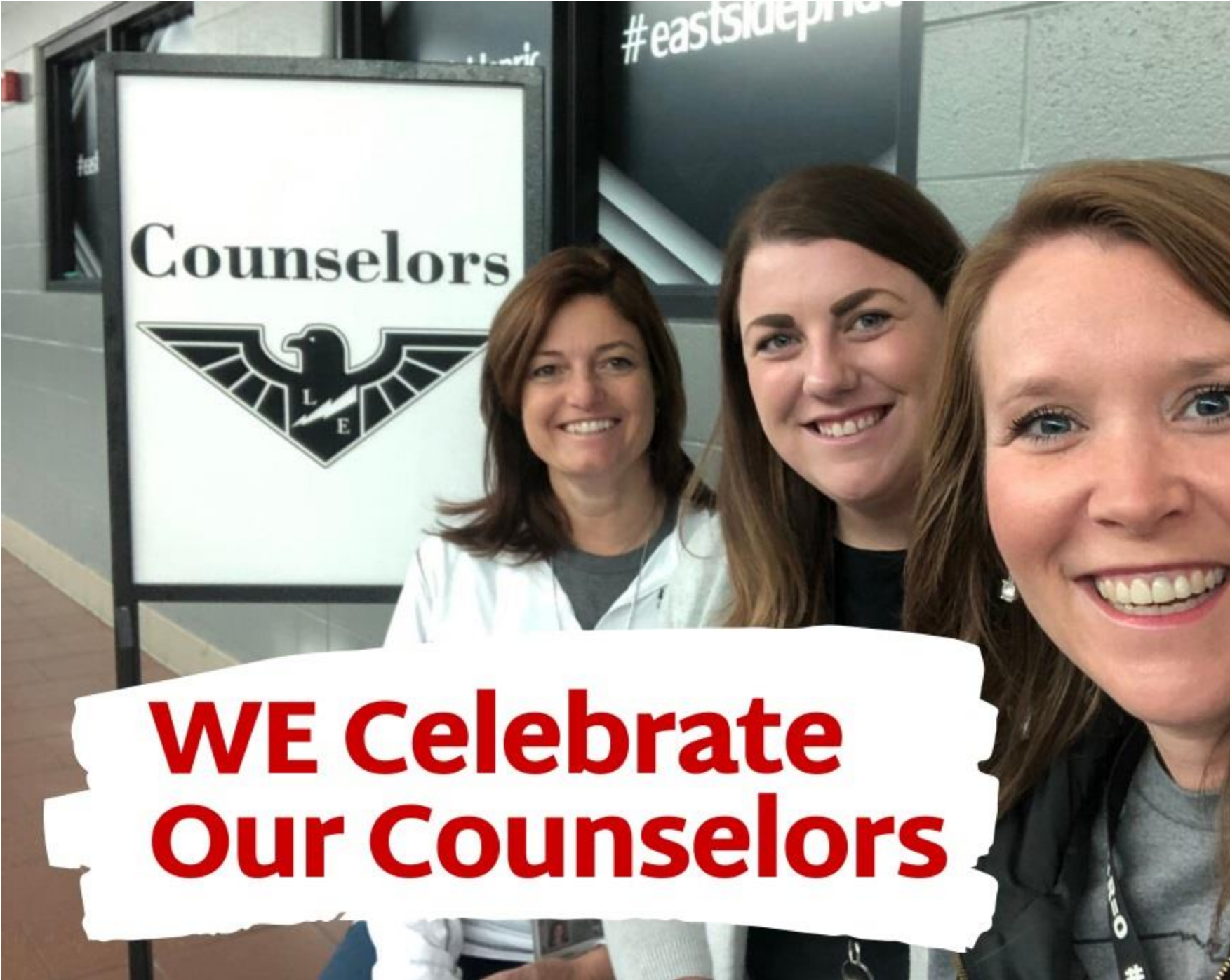
Lakota's School Counselors Wear Many Hats