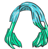
Un-Natural Hair Color