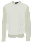
Sweaters or sweatshirts