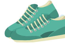
Shoes, Sneakers, Boots, and Sandals with heel straps