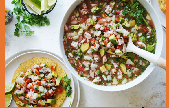
CEVICHE DE CAMARÓN (SHRIMP & VEGGIE APPETIZER)