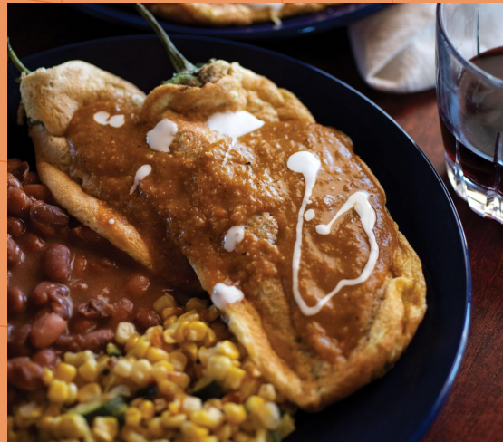
CHILES RELLENOS (ROASTED, CHEESE-FILLED CHILES, BATTERED, FRIED, & SAUCED)