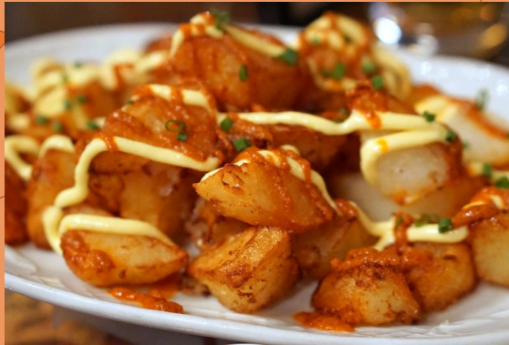
PATATAS BRAVAS W/ BRAVAS SAUCE & AIOLI (FRIED POTATOES W/ RED SAUCE & AIOLI)