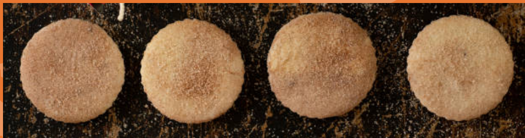
BIZCOCHITO (OFFICIAL STATE COOKIE OF NEW MEXICO)