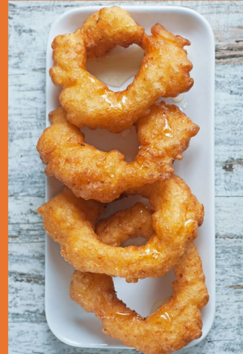
PERU: PICARONES (PUMPKIN OR SQUASH DOUGHNUTS)