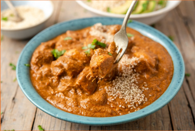
GUATEMALA: PEPIÁN DE POLLO (SPICED CHICKEN STEW)