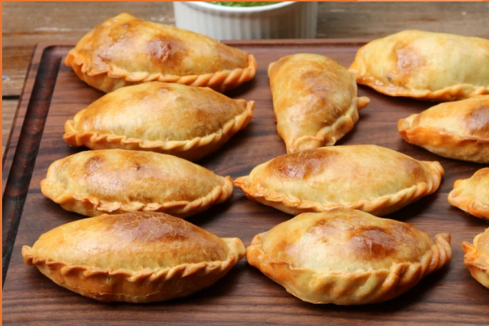
ARGENTINA: EMPANADAS (FILLED PASTRY SAVORY OR SWEET)