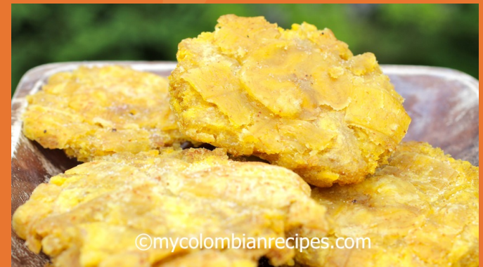
COLUMBIA: PATACONCES (FRIED, SMASHED, GREEN PLANTAINS)