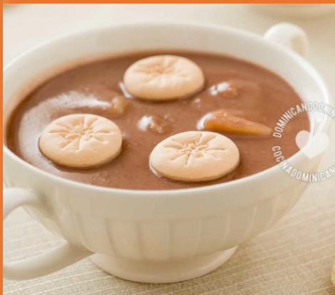
DOMINICAN REP.: HABICHUELAS CON DULCE (SWEET CREAM OF BEANS)