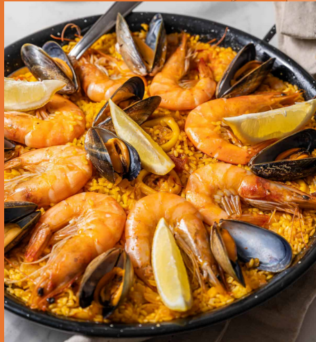
SEAFOOD PAELLA (SEAFOOD RICE)