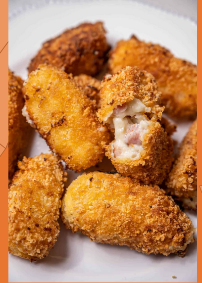
CROQUETAS DE JAMÓN (FRIED BECHAMEL & HAM CROQUETTES)