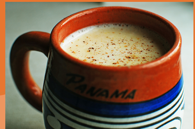
PANAMA: CHICHEME (SWEET CORN DRINK)