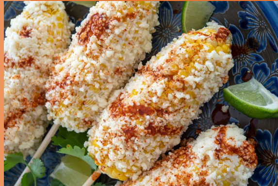
ELOTE (STREET CORN)