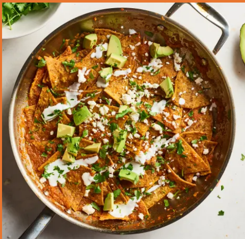
CHILAQUILES (FRIED TORTILLA STRIPS, SAUCED AND TOPPED WITH CHEESE)