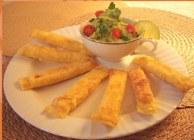
PERU: TEQUEÑOS WITH GUACAMOLE CHEESE-FILLED WONTON WRAPPERS, FRIED)