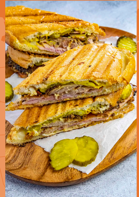
CUBANOS (PORK, HAM, MUSTARD, & PICKLE SANDWICH)