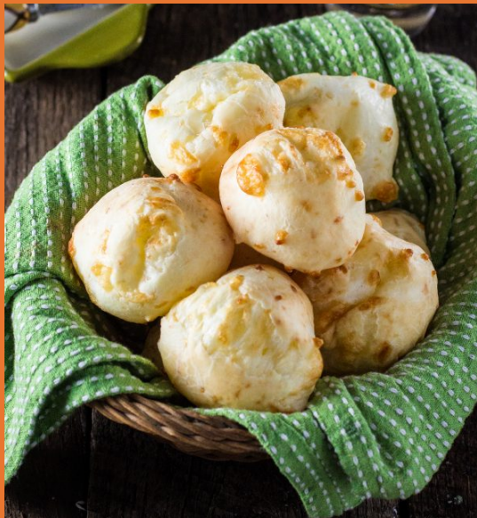
BRAZIL: PÃO DE QUEIJO (CHEESE BREAD)