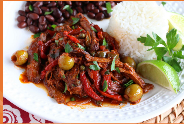
CUBA: ROPA VIEJA "OLD CLOTHES" (SHREDDED BEEF AND VEGETABLES)