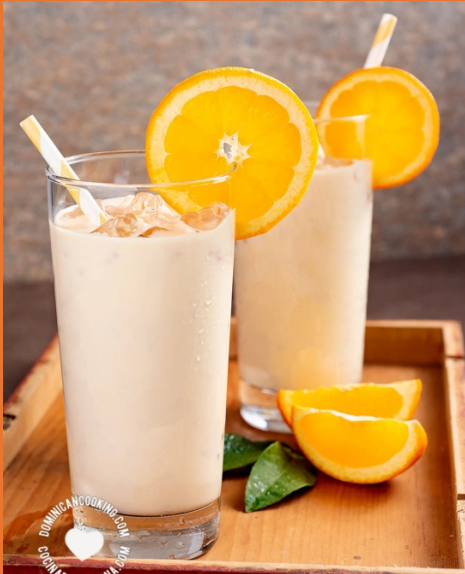
DOMINICAN REP.: MORIR SOÑANDO "TO DIE DREAMING" (ORANGE JUICE, EVAPORATED MILK, AND VANILLA)