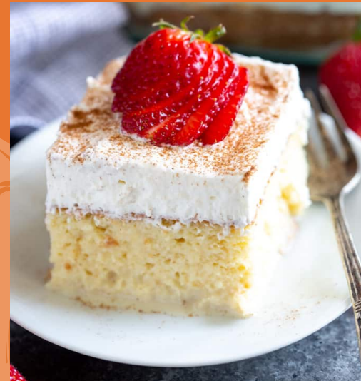
NICARAGUA: PAN TRES LECHES (THREE MILK CAKE)