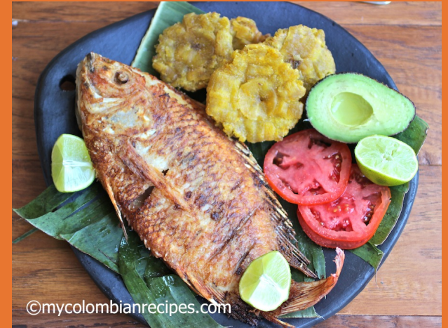
COLUMBIA: PESCADO FRITO (FRIED FISH, SERVED WITH FRIED, SMASHED, GREEN PLANTAINS)