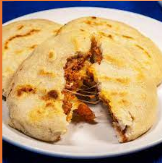
EL SALVADOR: PUPUSAS CON CURTIDO (PORK, BEAN, AND CHEESE FILLED DOUGH, FRIED AND TOPPED WITH CABBAGE RELISH)