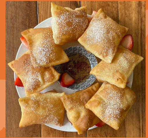
SOPAPILLAS (FRIED DOUGH, TOPPED WITH CINNAMON SUGAR, AND SERVED WITH HONEY)