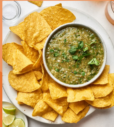
SALSA VERDE (GREEN SALSA)