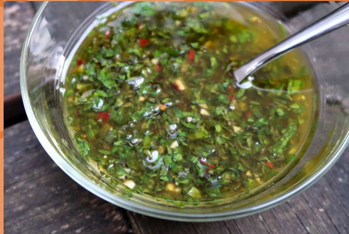
ARGENTINA: CHIMICHURRI (HERBY, OIL, AND VINEGAR SAUCE)