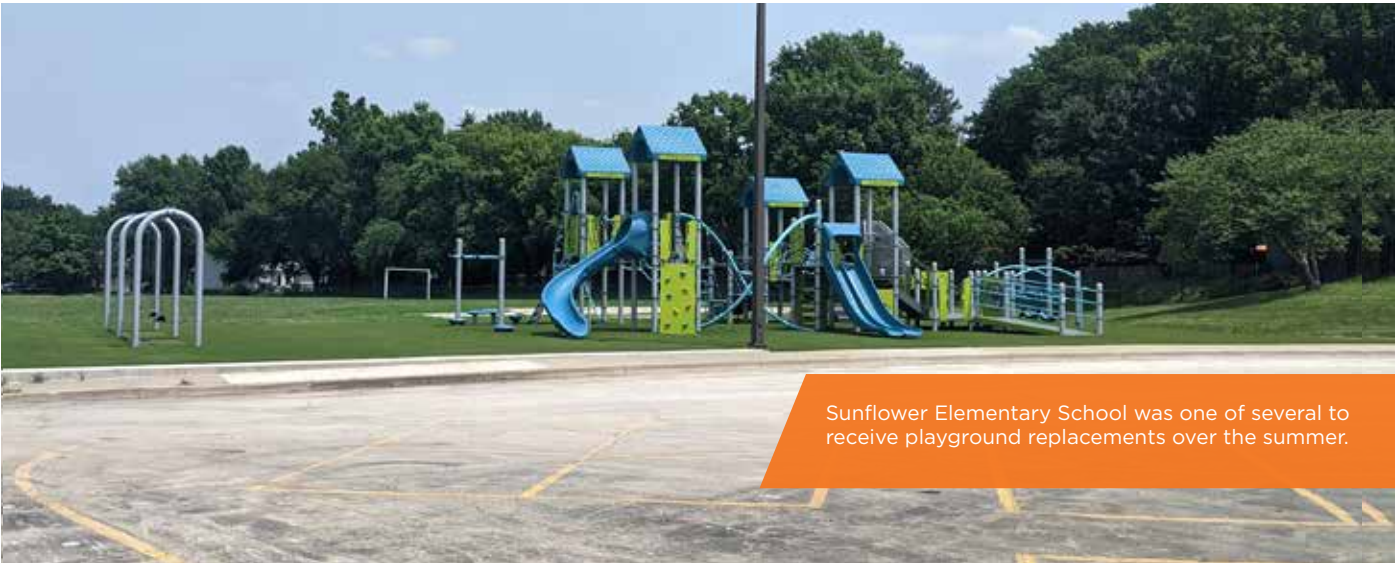
Sunflower Elementary School was one of several to receive playground replacements over the summer.

In the next few months, weight room additions and restroom renovations will be made at Shawnee Mission North High School. Shawnee Mission Northwest High School's restrooms and commons are being remodeled. Indian Woods Middle School will also undergo a restroom remodel and add a three-story addition.