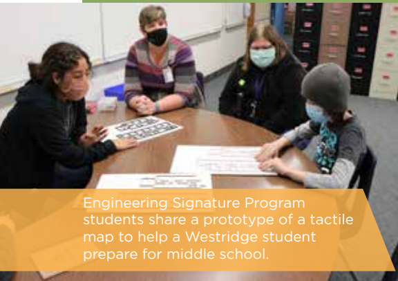
Engineering Signature Program students share a prototype of a tactile map to help a Westridge student prepare for middle school.

If your business or organization is interested in connecting with the SMSD to help students earn MVAs, please contact 913-993-9360. 📍