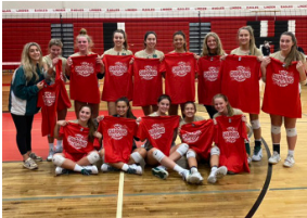
The Notre Dame Varsity Volleyball team went 6-0 to take first at the Linden Invite