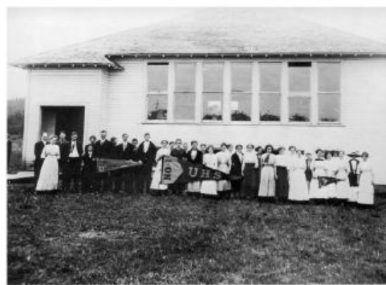
Some of the Pleasant Hill students and faculty of 1912-13 pose for the school picture. The whole school consisted of 56 students and 4 faculty members. In common are the 27 students and 17 faculty members of 1906.