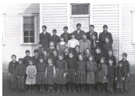
PLEASANT HILL SCHOOL • 1906

We will present a series of pictures over the year, trying for one new one each week. A larger version can be seen by clicking on these small ones. size 300 dpi versions will be available on a CD from the webmaster .