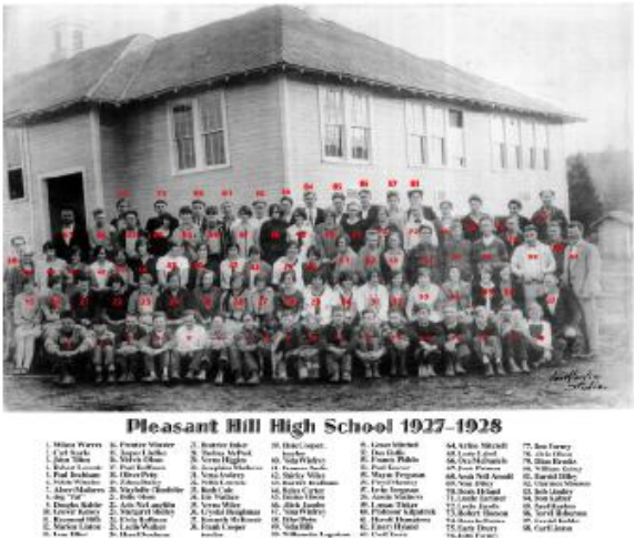
PHHS in 1927-1928