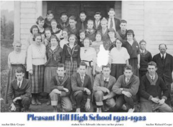
PHHS in 1921-1922