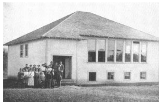
New Pleasant Hill School in 1910