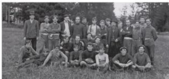
PLEASANT HILL ADULT BASEBALL TEAM • 1912