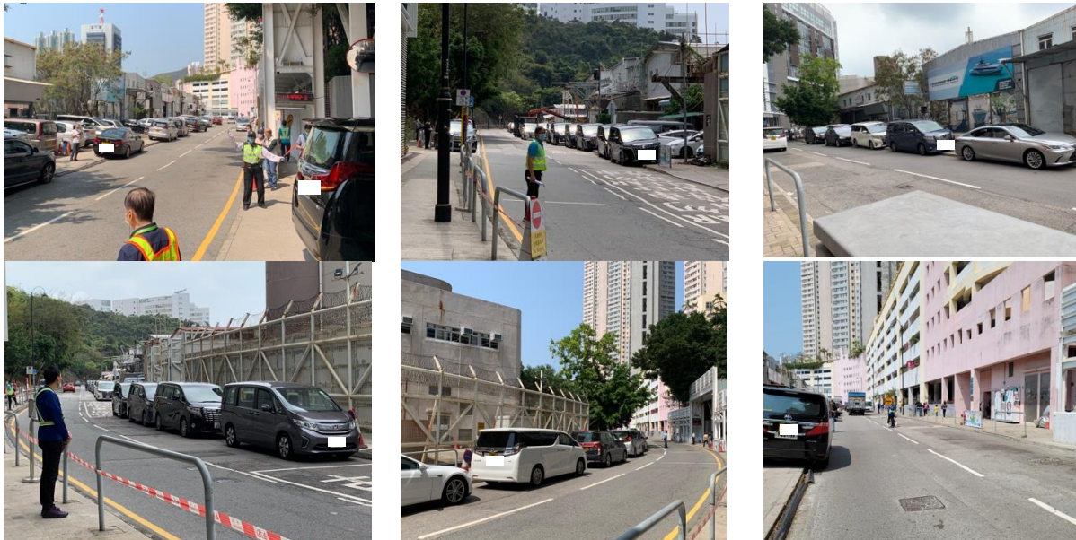
Our school community drivers showing their cooperation in keeping good order

Last but not least, we also thank members of our local community for their kind understanding that we, as a school, are making our best efforts in maintaining an orderly environment in our neighbourhood. We value, we strive and we act.