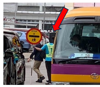
The traffic control team taking actions to regulate traffic at Shum Wan Road