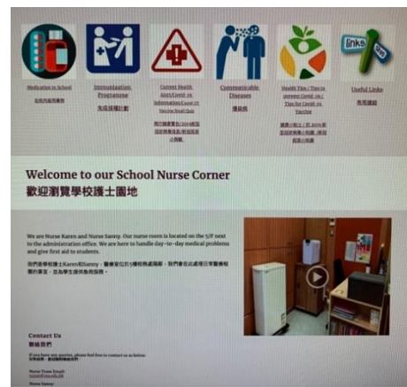
QR Code to our nurses' website on updated health information