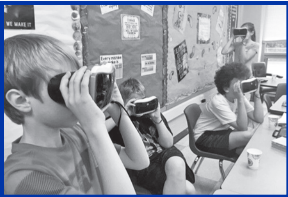
5th and 6th Graders creating Google Virtual Reality Expedition