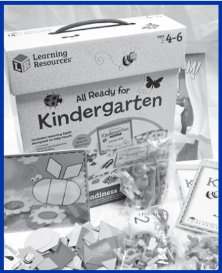
Kindergarten Readiness Kit