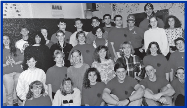
Annie Cast 1992

To celebrate the golden anniversary, GSPA presented the classic Kaufman & Hart comedy “The Man Who Came to Dinner” in the fall, and the crowd favorite musical “Annie” in the spring. For the first time in over twenty years, GSPA ran its spring musical for two full weekends.