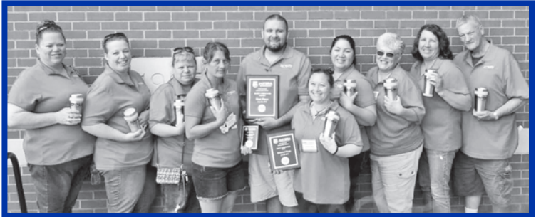
IU13 Bus Driver Representatives at the PA State School Bus Safety Competition