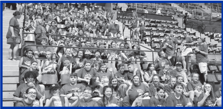
Middle School Band, Chorus, Jazz Band, Orchestra, and World Beat at Hershey Park

Each year the Educational Programs Network hosts Music in the Parks, a festival for musical ensembles from all over the United States to perform for adjudicators or master teachers who then rate the ensembles and provide suggestions on how students can improve their performance. The day ends with an awards ceremony presented to either a single player or a whole ensemble. This year at the Music in the Parks festival at Hershey Park in May, the students in the Garden Spot Middle School Band, Chorus, Jazz Band, Orchestra, and World Beat ensembles, performed at the highest level, both on and off the stage. Every group received a first place in their division and great feedback from their adjudicators.