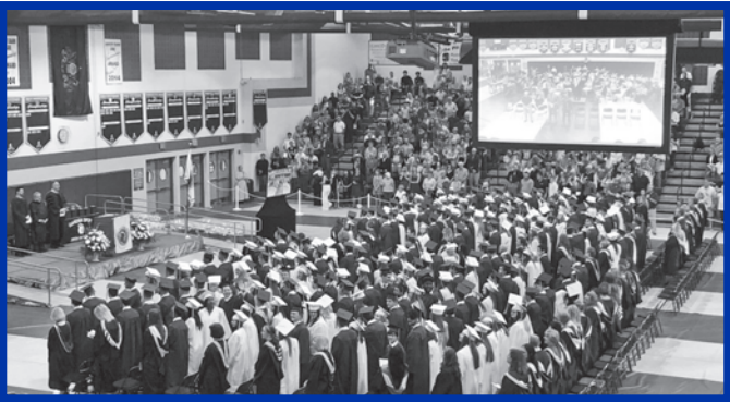
Graduation Commencement 2018