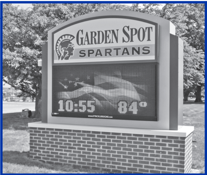
New Garden Spot Campus Sign

Students researched using Google Classroom, wrote reports, and created backgrounds for the habitats of each animal. They dressed up and shared with parents what they had learned. Students shared where their animals live, what they eat and other interesting facts. Parents walked through the museum and when they stepped on a student’s push button, that student would read his/her research report. They did an awesome job researching, writing and sharing all that they had learned!