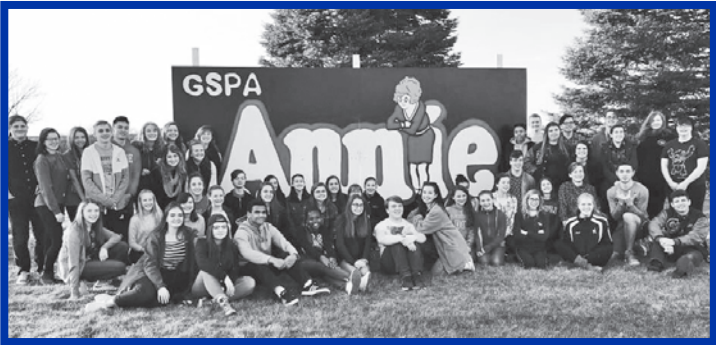
Annie Cast 2018

This past school year, Garden Spot Performing Arts (GSPA) celebrated its 50th anniversary—quite a milestone in our county’s high school theatre scene.