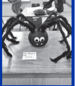
Boo Bash Entries