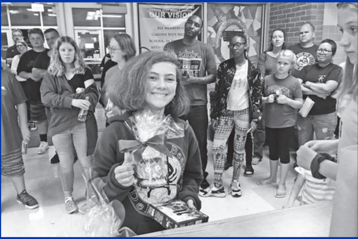
Prizes being raffled off to attendees at Family Fun Night

Garden Spot Middle School Student Council hosted their Second Annual Family Fun Night this past October. This event welcomed middle school students and their families to participate in a variety of activities hosted by our teachers. Some activities included candle making, cupcake decorating, bingo, and puzzle competitions. Families were also provided with a catered meal donated by Du'Jour Catering. Local businesses donated raffle prizes for this event. Student Council is in the works of planning another one of these events for the Spring!