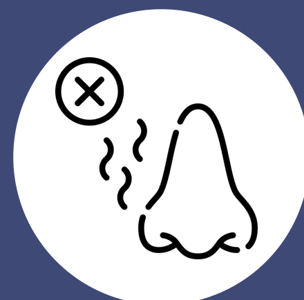
Loss of taste or smell