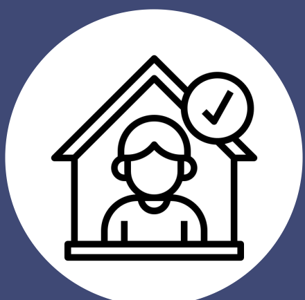
Stay home and self-isolate