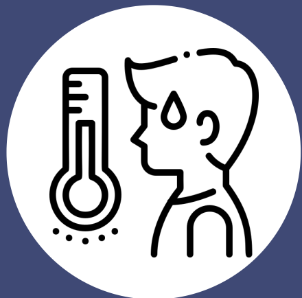
A temperature of 100° F or higher