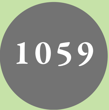
Number of tests taken by students