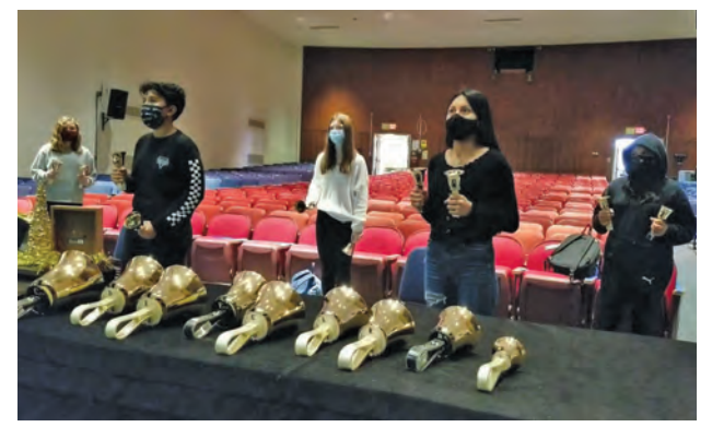
FMS choral students rehearsing for their Virtual Winter Concert using handbells received from a $15,250 grant from the MEF to allow for in-person collaborative music making! 250 students expanded their musical aptitude and students will continue to do so through this lasting program at Frelinghuysen.

Finally, in May, Morristown High School welcomed audiences to the Spring Concert—the District's first in-person concert since December 2019. Families brought blankets and lawn chairs to the