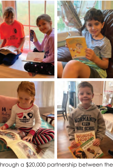
Through a $20,000 partnership between the MEF and a generous donor, all K-5 students received grade-level book packets and MEF bookmarks to encourage literacy and ensure virtual and in-class students had access to the same reading materials. Teachers also received a set of the same texts to use in instruction and read

To help preschool students learning at home, $3,000 of select school supplies were provided to Lafayette Learning Center students to allow for hands-on learning during remote instruction. These materials included cravons, pencils, white boards