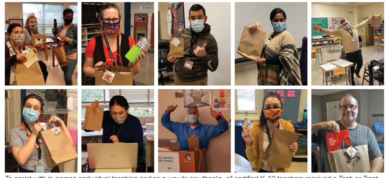
To assist with in-person and virtual teaching and as a way to say thanks, all certified K-12 teachers received a Tech or Treat bag with Halloween treats or technology materials. Purchased materials included USB conference microphones, wireless pocket mouses, desktop computer speakers, blue light glasses, Bluetooth headsets with microphones, and more!

Hartman says she has been inspired by the resourcefulness of the District's teaching and counseling staff: "They came up with great strategies to engage our students and present clear and quality content, and many of them went far outside their comfort zone to learn new programs, applications, and digital teaching methods. As difficult as things were at times, I am so proud of our faculty and staff for the way they rose to the occasion and pushed themselves to make sure our students' instructional needs were met, no matter what the mode of delivery."