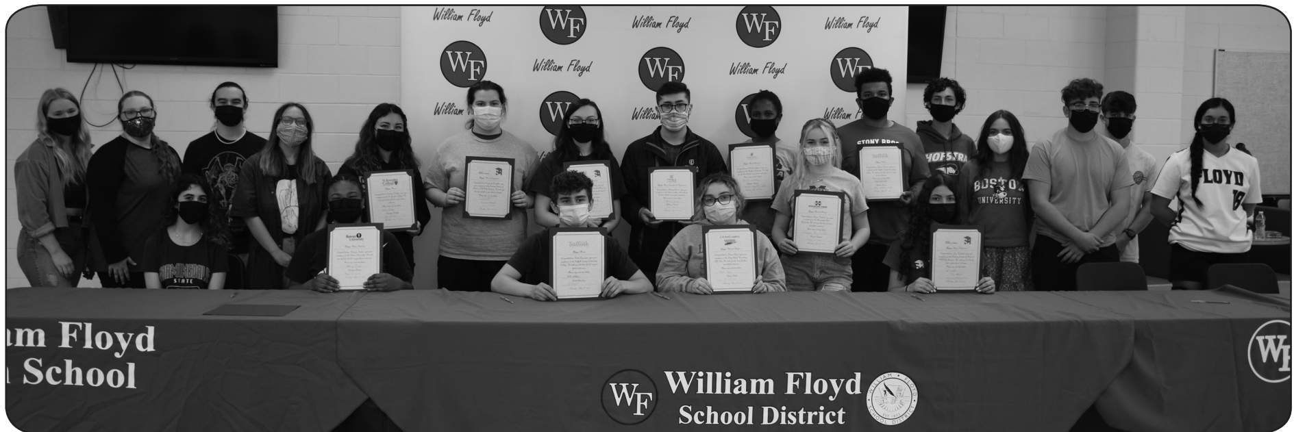
William Floyd High School members of the Class of 2021 who will be majoring, minorng or participating in a music ensemble in college are pictured at the annual music signing day event.