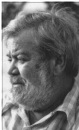
FREDERICK EXLEY Class of 1947

Acclaimed author and literary figure whose first novel, A Fan's Notes, drew upon his experiences in Watertown. His "fictional memoir" is regarded as one of America's best post-WWII novels and earned Mr. Exley the 1969 William Faulkner Award and the Rosenthal Foundation Award for best first novel. In placing Watertown on America's literary map, Mr. Exley wrote honestly about his life and the pursuit of fame and celebrity.