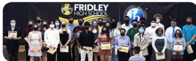
Over 120 Fridley seniors were honored at the 63rd annual Scholastic Achievement Awards Ceremony, an event that recognizes student excellence and achievement. Pictured are Class of 2021 seniors who earned "Highest Honors," earning a 3.75 GPA or above along with six semester credits in three IB DP classes.

Over 120 graduating Fridley High School (FHS) seniors were honored at the 63rd annual Scholastic Achievement Awards Ceremony, held on May 20, 2021. The event, sponsored by the Fridley Lions Club, recognizes student excellence and achievement. Our distinguished students were also honored for their tremendous participation and leadership in activities and athletics. In addition, over $144,000 of Fridley Schools Foundation Community Scholarships were awarded to graduating seniors. The Fridley Community Scholarships program began in 1968 and continues to thrive as Fridley and the surrounding community maintains a rich history of strong community support. Scholarship support is donated by local businesses, service groups and individuals through the Foundation. Thank you Fridley community for your unwavering support in helping students reach their fullest potential.