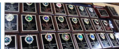
Seniors were awarded with Activities and Athletics Awards for their leadership, talent and achievements in Fridley activities through their high school careers.